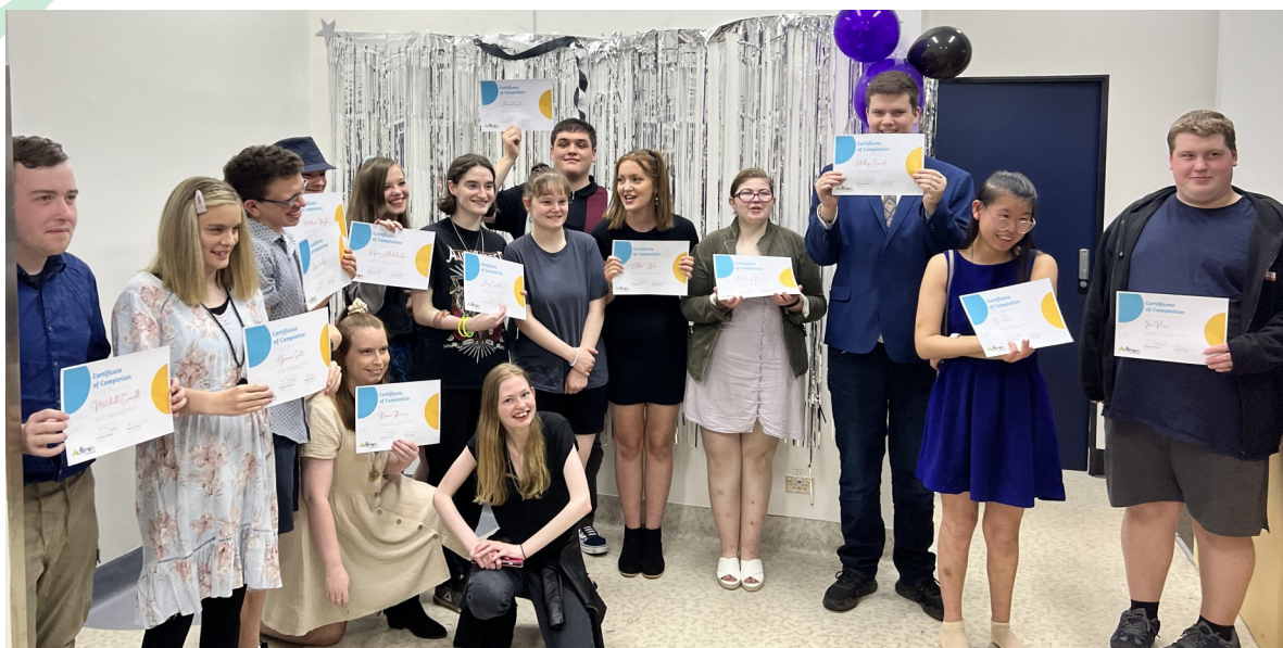
Achieve Graduation Class of 2021

We have 16 new students this year and everyone is embracing 2022.