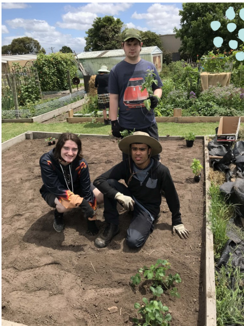
Biodome Elective students at the Knox Community Gardens